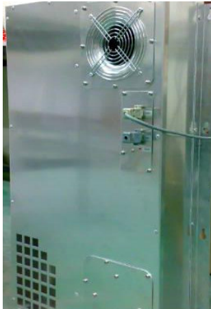
Figure 1. View of Hex37A